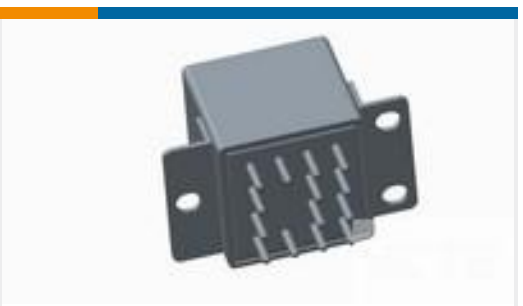
TE Part # 3-1617805-3 TD230-5003P=TDAO50-500SECM83726/30-5003P