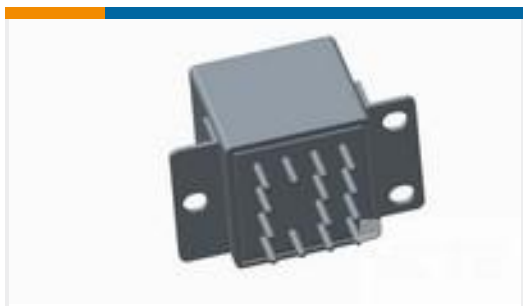
TE Part # 1-1617805-8 TD228-1002P=TDFO 10 SEC M83726 /28-1002P