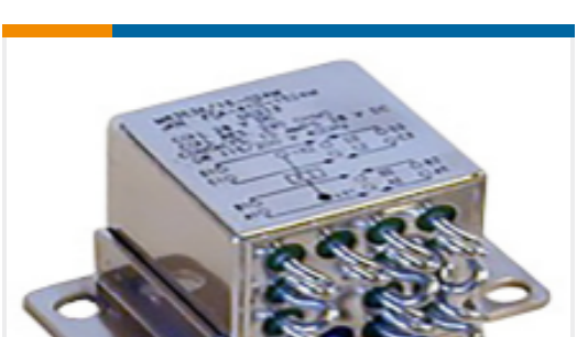
TE Part # 3-1617805-1 TD229-3002S=TDFR 30 SEC