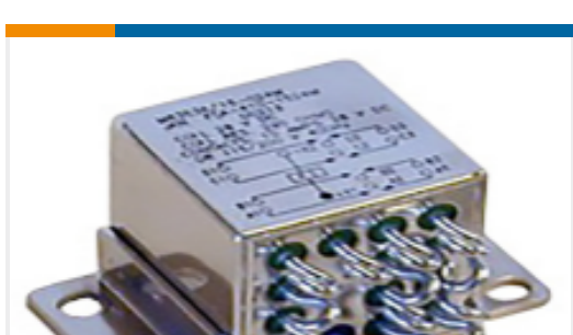
TE Part # 2-1617789-3 FCA-410-CY5=MIDRANGE RELAY